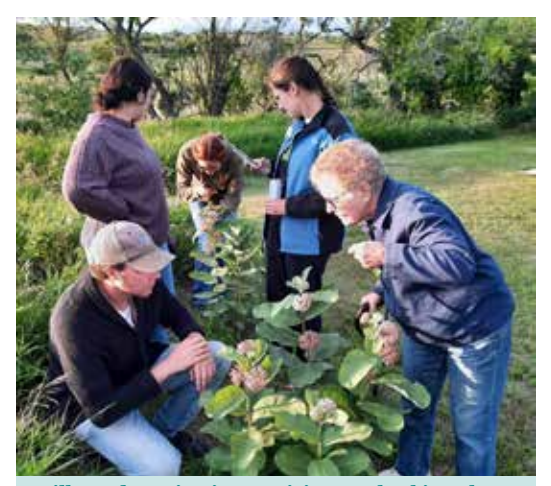
Milkweed monitoring participants checking plants for signs of Monarchs.