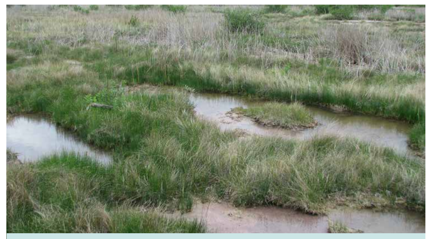
Prairie fens may or may not have pools of water, such as these, visible at their surface.