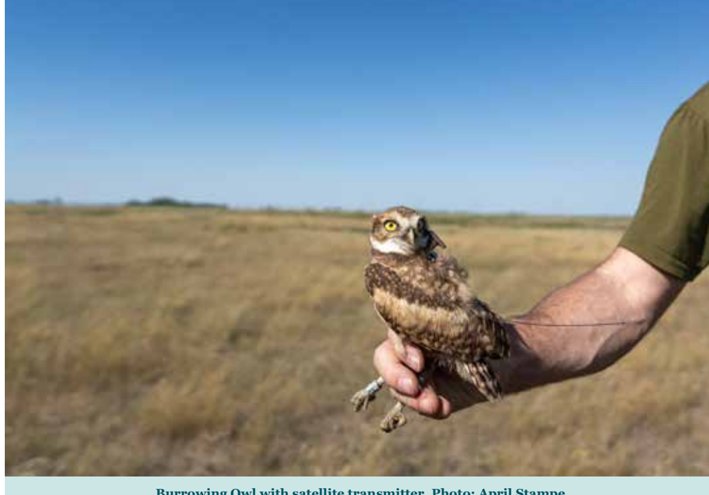
Burrowing Owl with satellite transmitter.

hold up well with cattle grazing around them. Many landowners in southwestern Manitoba have allowed MBORP to install these burrows in pasture to provide more available nesting options for burrowing