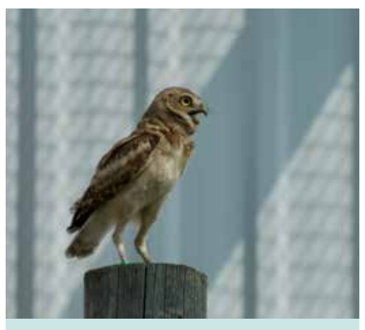
Burrowing Owl on fence post.

For more information visit our website at livingskywildliferehabilitation.org and our Facebook page by searching for LivingSkyWildlifeRehabilitation.