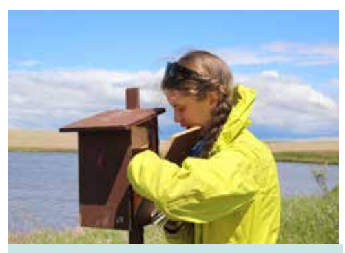
Mercy visits a Tree Swallow nest box to monitor nestlings and collect fecal samples.

both foraging habitat and sources of prey for swallows, especially nestlings. The fact that Barn and Tree Swallows largely used the same habitats and ate similar types of insects is interesting given that Barn Swallows are not usually associated with wetland habitats. This raises the question of whether there are other species for which we don't yet fully appreciate the importance of wetlands! Overall, this study adds to the already large body of evidence emphasizing how important wetland conservation is for Saskatchewan's wildlife. Whether we're conserving wetlands for waterfowl. swallows, or other wildlife, they are essential to keeping our living skies healthy and biodiverse!