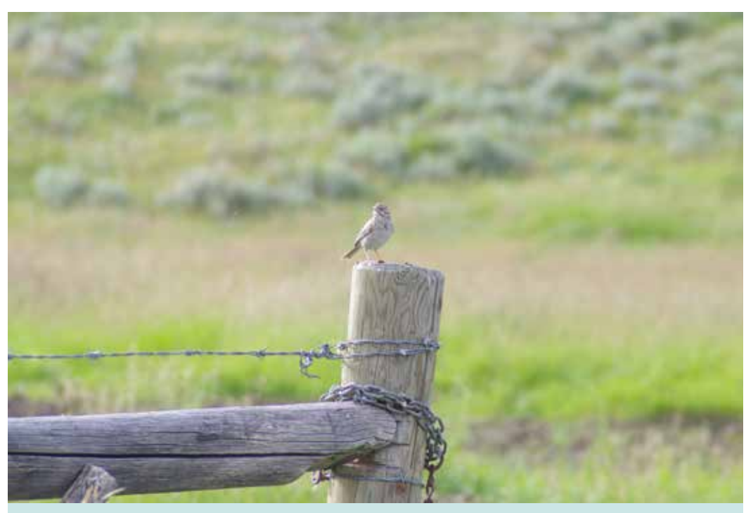
Native grasses provide great forage as well as habitat for many native songbirds.