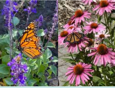
Monarchs on nectaring plants.

Our SOS Banner Program census is well underway, with 33% of program participants responding with their species sightings so far. To date, stewards have reported 670 adult Barn Swallows, 220 chicks, and 96 nests; 59 adult Ferruginous Hawks, 17 chicks, and 16 nests; 2 Short-eared Owls; 20 Badgers; 80 Sprague's Pipits; 6 Bobolink; 64 Common Nighthawk; 102 Northern Leopard Frogs; and 12 adult Tiger Salamanders. We had an unexpected highlight this summer from a new participant who had nearly 1,000 juvenile Tiger Salamanders call their pond home! In addition to the numbers above from the pilot project, we have also had 39 adult Monarchs and 38 caterpillars reported through our census so far!