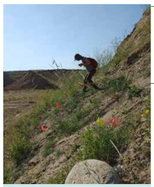
RPR crew surveying rare plants.

Another highlight was getting to visit with 17 of our current participants and discuss the voluntary program with 21 potential participants, adding 6 new landholders to the program which now totals 96 participants conserving nearly 270,000 acres of prairie. Although RPR typically never collects plant material, we were also able to contribute to both a moss and an Echinacea research project. We are very grateful to the landholders that allowed us to collect samples and look forward to hearing how these projects turn out.