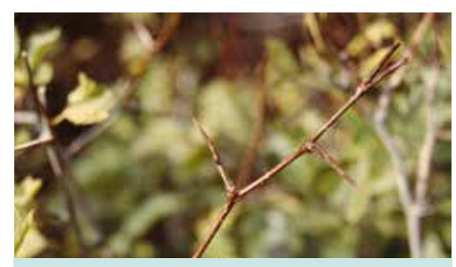
Hawthorn thorns.

encourage nesting by providing opportunities for shrikes to see prey and predators. They also prefer die-back branches, as taller dead branches make great look-out perches. As long as they aren't too tall to also make great predator perches.