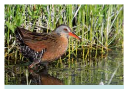
Virginia Rail.

MarshWatch is a free 10-part webinar series designed specifically for the prairie provinces. We'll dive into tips, tricks, and behavioural cues to identify ~50 species of wetland birds and frogs by sight and sound. The gentle interactive pace of less than 10 species per week means you won't