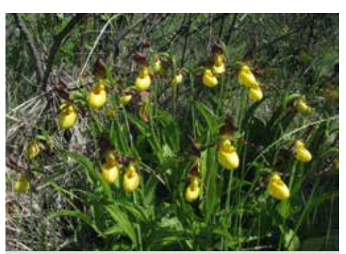
Small-yellow Lady's-slipper is a showy orchid found in prairie fens.

Plants that are common in the north are seen only in these fen habitats far to the south: bog birch, tufted club-rush, sundew, and cotton-grasses can all be found in this unique habitat. So far, four orchid species have also been found in Saskatchewan's prairie fens: yellow lady's-slipper, hooded ladies'-tresses, yellow bog/fen twayblade,