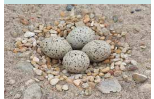
Piping Plover nest.

If you spot a plover like bird, look for the right habitat markers and for rings around the bird's neck. If there are two rings, you are likely looking at a Killdeer; a tricky lookalike that will nest everywhere from mudflats to parking lots. If you see one ring, and your habitat sounds just like above, then you've got yourself a plover!