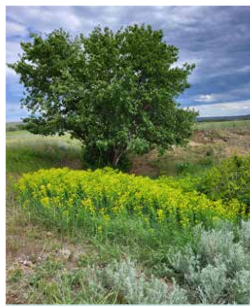
Leafy Spurge easily invades beautiful native prairie.

half the amount. Funding is limited and not guaranteed to everyone who applies.