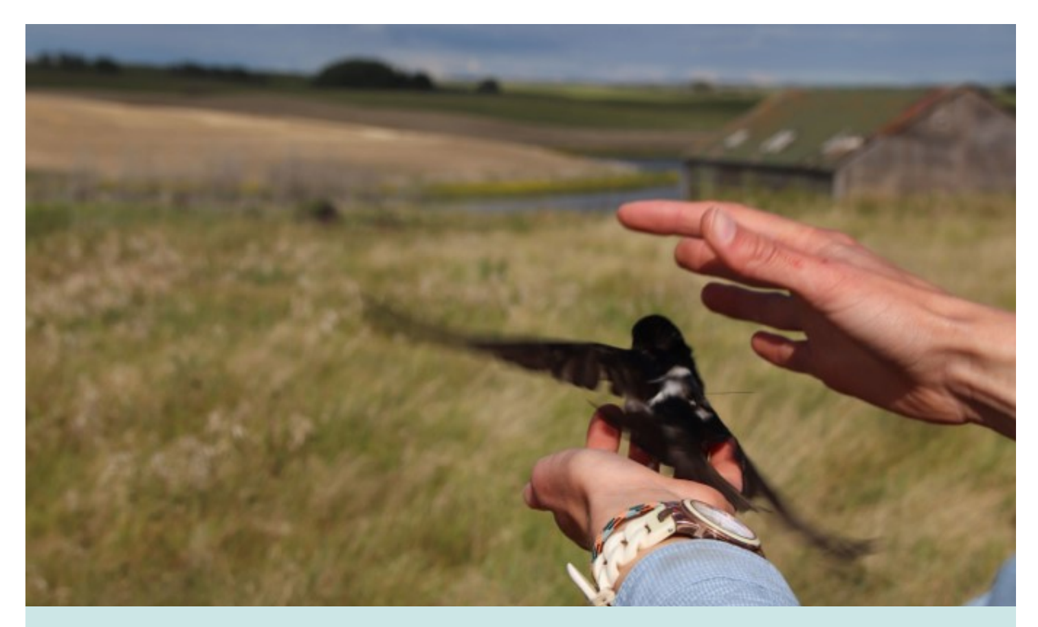
Mercy releases a Barn Swallow that has been fitted with a GPS tag. The bird will be recaptured two days later to retrieve the tag and download its data.

metabarcoding" can use that DNA to identify the species of insects that a bird ate. I found that both Barn and Tree Swallows frequently ate craneflies (emergent insects that have their larval stage in wetlands) and houseflies. Interestingly, nestling swallows ate craneflies and other emergent insects significantly more frequently than adults, and birds' diet composition was affected by the amount of wetland present near the birds' nest. Taken together, this suggests that wetlands shape the diet of swallows and are an important source of insect prey.